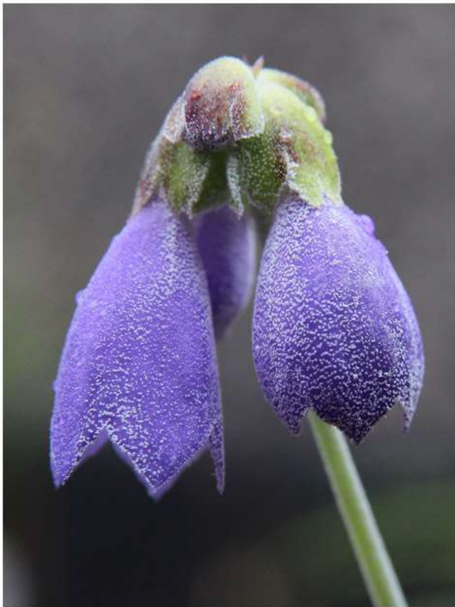
Back Cover : Primula wollastonii , from seed, by David Ledsham Front Cover : Rhodophiala rhodolirion , (Photo : Joan McCaughey)