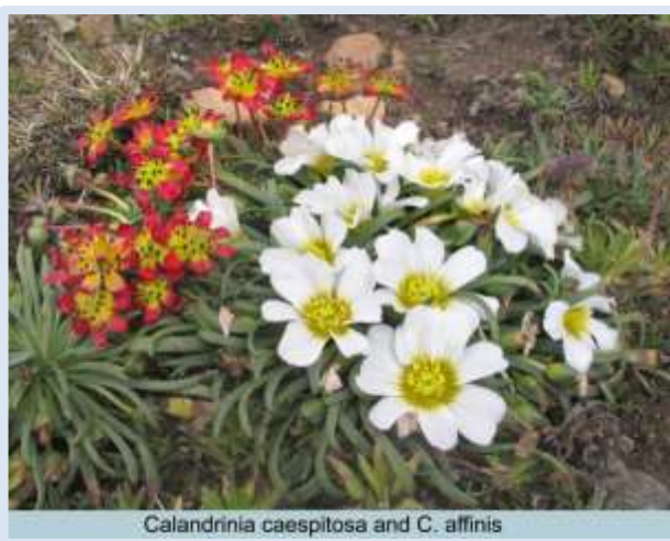
Calandrinia caespitosa and C. affinis

Mindful of David's remarks I have included photos of a few plants that might be grown here, given protection from frost and wet - Calandrinia affinis and C. caespitosa were found growing together giving a floral display of every hue and colour- Chaetanthera spatulifolia - definitely one for the alpine house as is the Rhodophiala