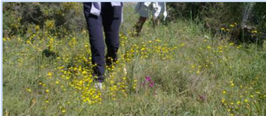
Walking through the scrubland flora

We visited Crete in April 2006, and stayed on a hillside overlooking the village of Plaka, above the beach at Almereida, on the north coast of Crete, east of Chania. On a piece of scrubland just above our villa, we saw a most wonderful collection of wild flowers. Those featured here are not the best that we saw, but the ones for which we have reasonable photographs.