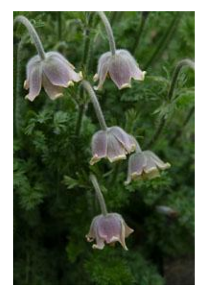
Meconopsis punicea (Harold & Gwens' garden)